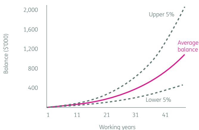
Variations in retirement balances at retirement